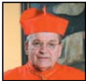
Raymond Leo Cardinal Burke Prefect, Supreme Tribunal of the Apostolic Signatura, named as a new member of the College of Cardinals by Benedict XVI

Restoring the Sacred Liturgy, the Summit of The Church's Life