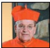
Raymond Leo Cardinal Burke Prefect, Supreme Tribunal of the Apostolic Signatura, named as a new member of the College of Cardinals by Benedict XVI

Restoring the Sacred Liturgy, the Summit of The Church's Life