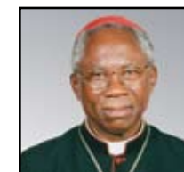
Prefect Emeritus of the Congregation for Divine Worship and the Discipline of the Sacraments "The Centrality of the Sacred Liturgy in the Evangelizing Mission of the Church"

His Eminence was ordained in 1958, was consecrated as bishop in 1965, and in 1967 was named archbishop. In the Consistory of May 1985, His Holiness Pope John Paul II proclaimed him Cardinal. His Eminence is a member of several Congregations, including the Congregation for the Doctrine of the Faith, and serves in other important positions of leadership and responsibility. We are especially grateful to His Eminence for so generously taking part in the Church Teaches Forum on numerous occasions and sharing the fullness and beauty of the Faith with us.