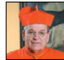
Prefect of the Supreme Tribunal of the Apostolic Signatura Spiritual Advisor of Eternal Life "Reform of the Reform"

His Eminence, while Archbishop of St. Louis, founded and built the Shrine of Our Lady of Guadalupe in La Crosse, WI, and dedicated this Shrine on July 31, 2008; he has served the Holy Catholic Church always with courage, charity, confidence and Truth. His Excellency was the first American to be appointed (by Benedict XVI) Prefect of the Supreme Tribunal of the Apostolic Signatura, and most recently was elevated as a new member of the College of Cardinals by His Holiness Benedict XVI (November 20 th , 2010).