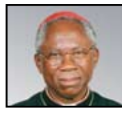
Francis Cardinal Arinze Titular of the Suborbarian Church of Velletri-Segni