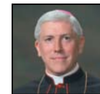
Auxiliary of the Archdiocese of Philadelphia Titular Bishop of Bardstown "Christ and His Church: The Mystery of This Dialogue in the Roman Missal"