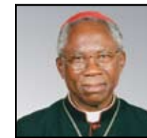
Prefect Emeritus of the Congregation for Divine Worship and the Discipline of the Sacraments "The Centrality of the Sacred Liturgy in the Evangelizing Mission of the Church"

His Eminence was ordained in 1958, was consecrated as bishop in 1965, and in 1967 was named archbishop. In the Consistory of May 1985, His Holiness Pope John Paul II proclaimed him Cardinal. His Eminence is a member of several Congregations, including the Congregation for the Doctrine of the Faith, and serves in other important positions of leadership and responsibility. We are especially grateful to His Eminence for so generously taking part in the Church Teaches Forum on numerous occasions and sharing the fullness and beauty of the Faith with us.