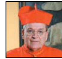
Prefect of the Supreme Tribunal of the Apostolic Signatura Spiritual Advisor of Eternal Life "Reform of the Reform"

His Eminence, while Archbishop of St. Louis, founded and built the Shrine of Our Lady of Guadalupe in La Crosse, WI, and dedicated this Shrine on July 31, 2008; he has served the Holy Catholic Church always with courage, charity, confidence and Truth. His Excellency was the first American to be appointed (by Benedict XVI) Prefect of the Supreme Tribunal of the Apostolic Signatura, and most recently was elevated as a new member of the College of Cardinals by His Holiness Benedict XVI (November 20 th , 2010).