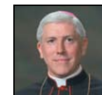
Auxiliary of the Archdiocese of Philadelphia Titular Bishop of Bardstown "Christ and His Church: The Mystery of This Dialogue in the Roman Missal"