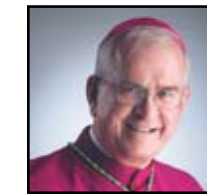
Archbishop of Louisville Vice President of USCCB Chairman of Bishops' Committee on Marriage Saturday: Main Celebrant of Mass; Homilist