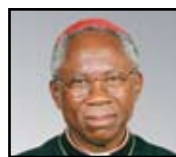
Francis Cardinal Arinze Titular of the Suborbanian Church of Velletri-Segni