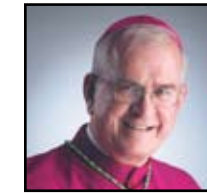
Archbishop of Louisville Vice President of USCCB Chairman of Bishops' Committee on Marriage Saturday: Main Celebrant of Mass; Homilist